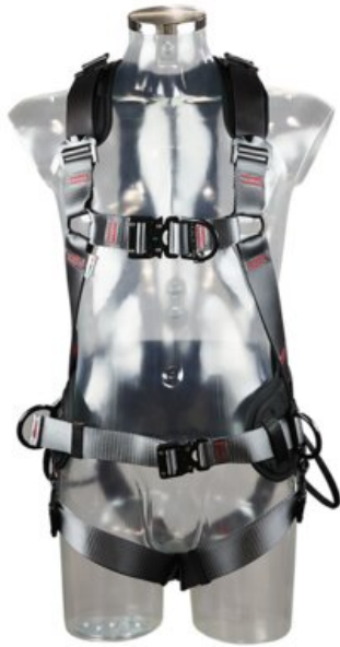
Work positioning D-ring